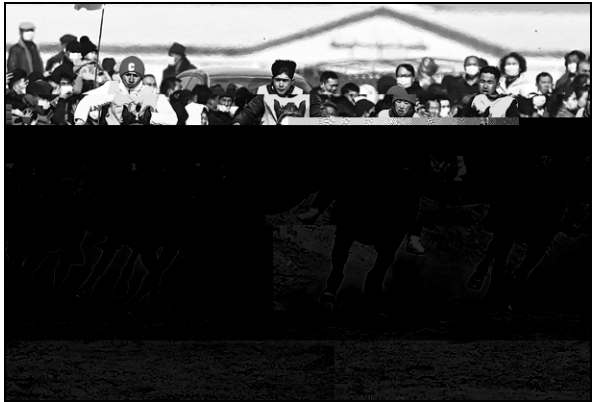
Herders compete in a horse race in Yuli county, Xinjiang Uygur autonomous region, on Saturday. A total of 127 herders tested their skills in horse riding and buzkashi, a Central Asian sport in which players on horseback try to place a goat carcass in a goal.